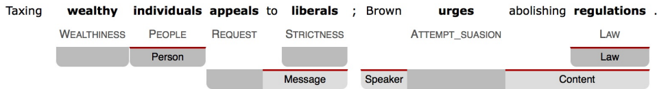
Figure 1: Frame-semantic parse from SEMAFOR for a constructed example sentence.

mation extraction, where there are often multiple knowledge bases containing related information but conforming to different ontologies (e.g., Riedel et al., 2013). We consider several possible modeling frameworks below in §4.